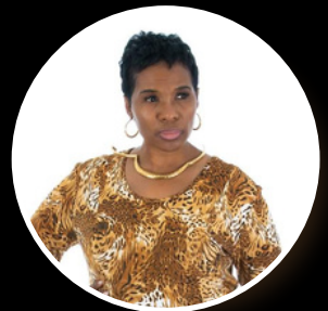
VAL Model Coach