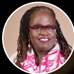
NOREEN Team Member