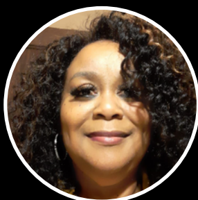
DEVVIE Team Member