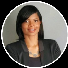
MAKELL Volunteer Coordinator