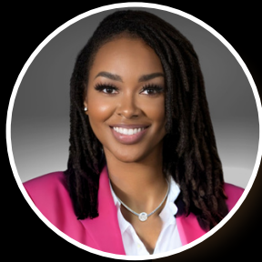
J'NAY Creative Director