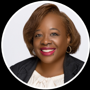
AKIA Event Coordinator